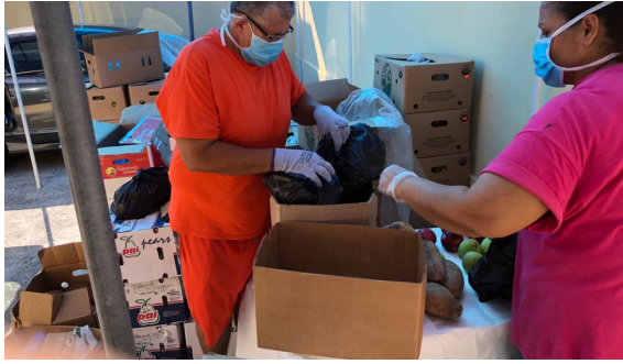
VAMOS Concertación Ciudadana volunteers in Guánica